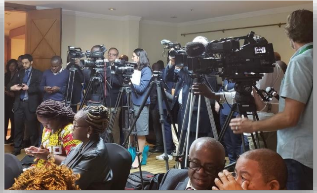
Historic Press Conference Hosted by 10 Governments Rejecting the Nairobi Summit

This rejection by 10 UN Member States of any outcome document from the Nairobi Summit is highly significant because it thwarts UNFPA's deceptive Nairobi plan to insert a right to abortion and to radical, fictitious sexual rights into the definitions of sexual and reproductive health (SRH) and reproductive rights (RR) in Target 5.6 that implement the UN Sustainable Development Goal (SDG) #3. This SDG target already obligates 193 Member States through 2030 to: