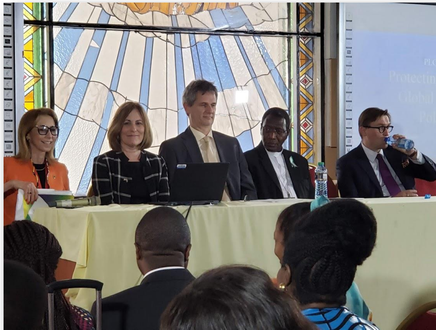
High-Level Government Officials Speaking on Intergovernmental Panel on “Pro-Life Global Health Policies”

High-level government panelists, some of whom are shown above, included: