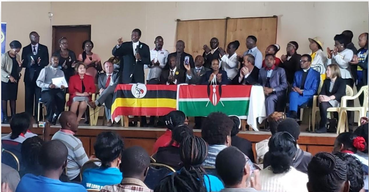
Launch of Alternative Nairobi Life and Family ICPD+25 Declaration

It is our greatest hope that a global alliance of all these likeminded countries on family and life issues will be formalized and continue to grow in strength and power to protect children and families worldwide.